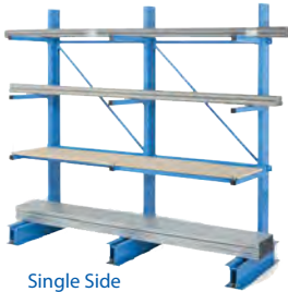
Single Side (SF-RACKHORZ6P-500 + SF-RACKHORZ6EP-500)