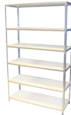
SF-RACKSTOR13A + SF-RACKSTOR13A-S

Each shelving unit features a strong galvanised steel frame and five melamine-faced shelves each capable of supporting 340kg of uniformly distributed load. This is class leading performance for demanding users. Available in two depths and two widths, these units will fix together to form a bespoke storage system. The units feature boltless assembly and are supplied complete with protective feet, mallet and safety weight loading labels.