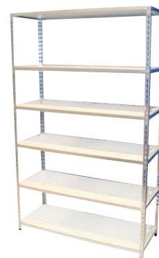
SF-RACKSTOR13A + SF-RACKSTOR13A-S

Each shelving unit features a strong galvanised steel frame and five melamine-faced shelves each capable of supporting 340kg of uniformly distributed load. This is class leading performance for demanding users. Available in two depths and two widths, these units will fit together to form a bespoke storage system. The units feature boltless assembly and are supplied complete with protective feet, mallet and safety weight loading labels.