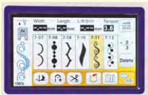
Built-in Sewing Stitches