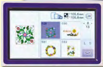
Built-in Embroidery Designs