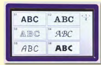
Built-in Embroidery Fonts