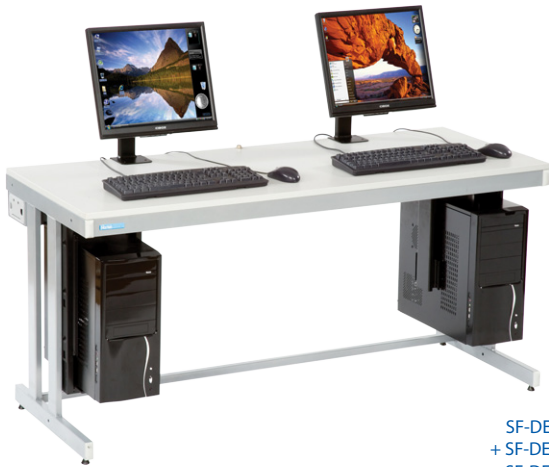
SF-DESK11H + SF-DESK-CPU1 + SF-DESK-MS1. (Computers not included)

Smart and robust workstations that represent an effective standard for ICT furniture. Each features comprehensive cable management and clever design details for flexible, modular arrangement. Optional adjustable monitor stands and lower CPU cradles can be added for a complete solution.