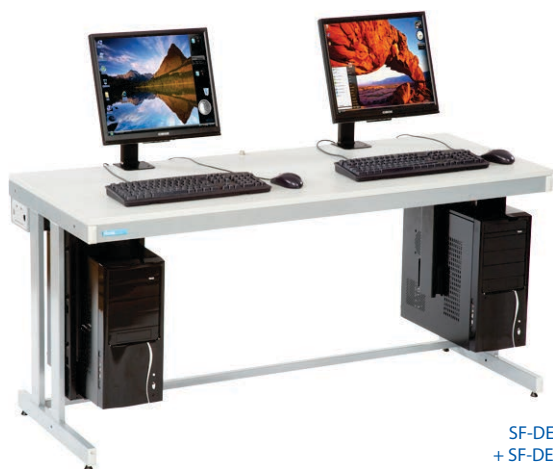
SF-DESK11H + SF-DESK-CPU1 + SF-DESK-MS1. (Computers not included)

Smart and robust workstations that represent an effective standard for ICT furniture. Each features comprehensive cable management and clever design details for flexible, modular arrangement. Optional adjustable monitor stands and lower CPU cradles can be added for a complete solution.