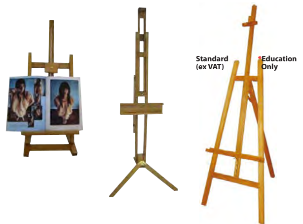
Table / Studio Easels

This range of high quality solid Elm easels will accommodate various sizes of canvases either table or floor standing.